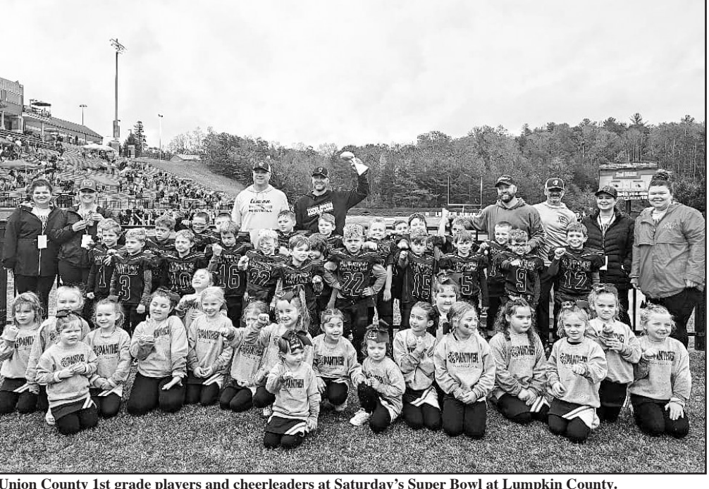
Union County 1st grade players and cheerleaders at Saturday's Super Bowl at Lumpkin County.