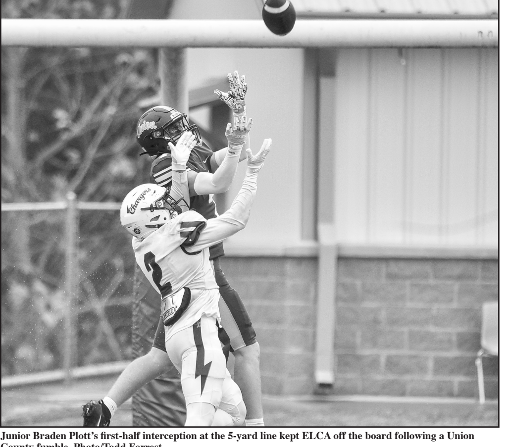
County fumble.

Kickoff is 7:30 p.m. Fri-"Fannin did some good day. Rockmart High is located at 990 Cartersville Hwy, Rock-