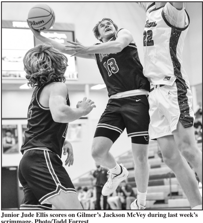
scrimmage.