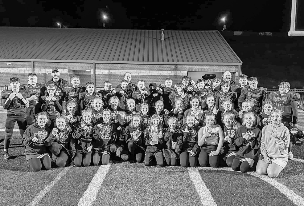
Union County 6th grade players and cheerleaders at Saturday's Super Bowl at Lumpkin County.